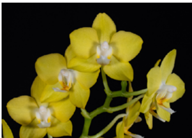
Phal. Lianher Lucky Cat