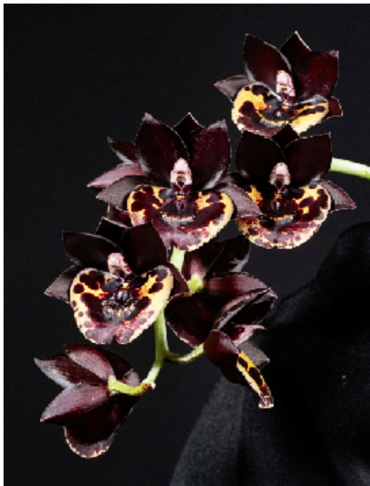
Catamodes Double Dragon 'SVO Black Gold'