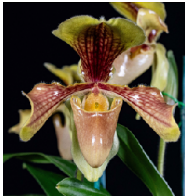
Paphiopedilum villosum 'O'sides Sunlight'