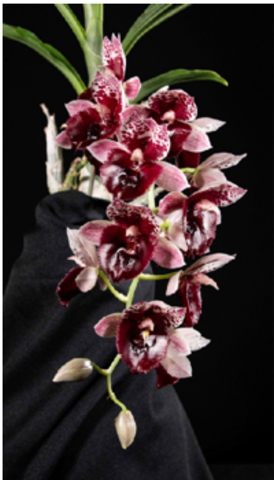
Catasetum AA Orquideas 'Dark Lips & Freckles'