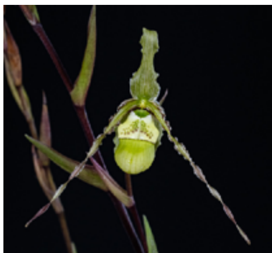
Phragmipedium x richteri