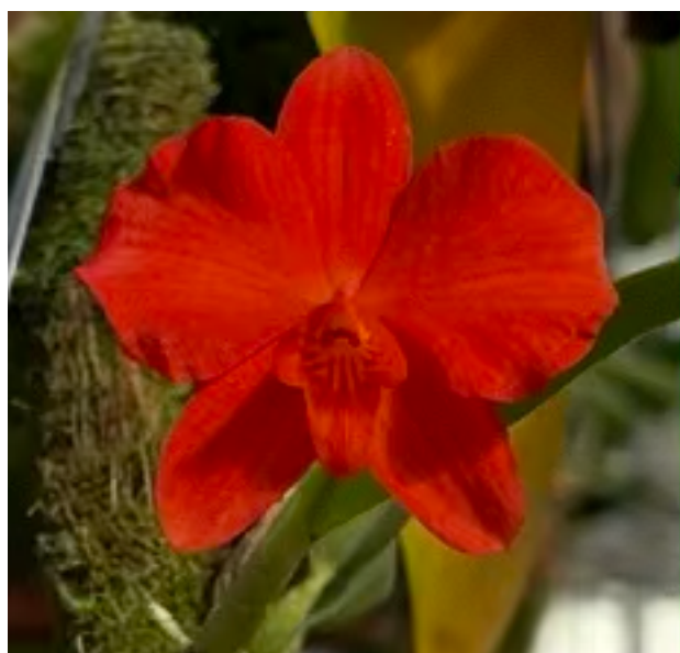
Sophronitis coccia 4N 'B.R.O.'