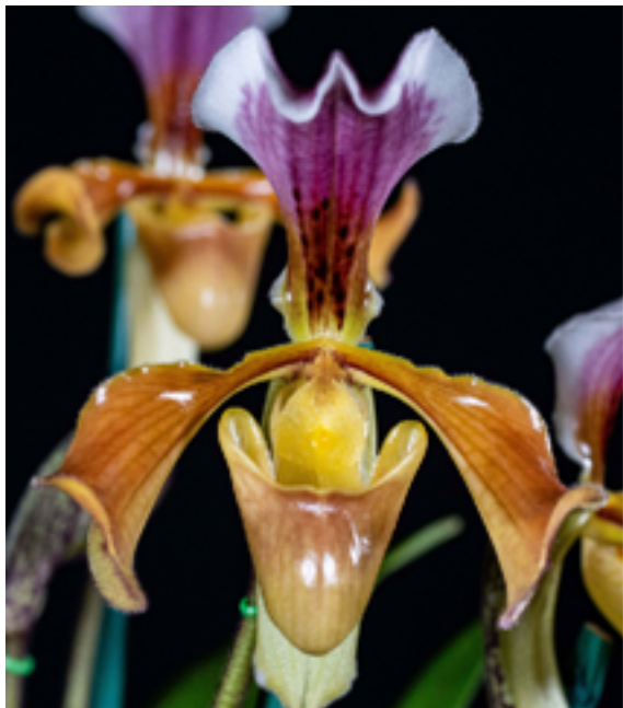
Paphiopedilum gratixianum 'Azores'